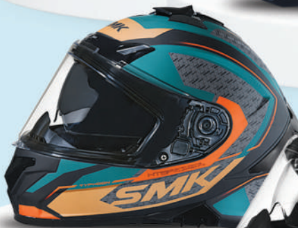
TYPHOON - RD1