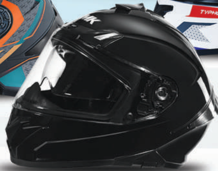
TYPHOON - Unicolor