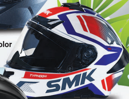
TYPHOON - Thorn