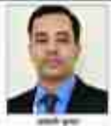
उत्कर्ष बैंक के अधिकारी

उत्कर्ष बैंक देश भर में करेगा कई बैंकिंग शाखाओं का परिचालन। उत्कर्ष बैंक देश भर में करेगा कई बैंकिंग शाखाओं का परिचालन। उत्कर्ष बैंक देश भर में करेगा कई बैंकिंग शाखाओं का परिचालन।