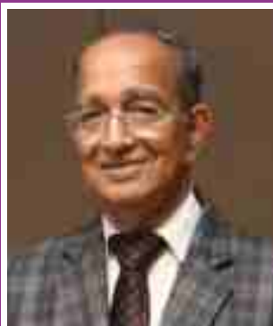
Dr. V. S. Sampath

Dr. V. S. Sampath is a 1973 Batch IAS Officer retired from the prestigious post of Chief Election Commissioner of India, and has held several important postings in Central Government, including a stint in the Union Ministry of Rural Development. As Chief Election Commissioner, Dr. Sampath pioneered several reforms in poll management, the primary among them being expenditure monitoring, setting up of flying squads and surveillance teams.