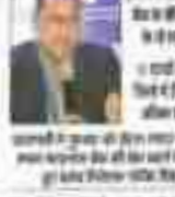
उत्कर्ष बैंक के अधिकारी

उत्कर्ष बैंक बैंकिंग के साथ स्वास्थ्य और शिक्षा पर विशेष जोर देगा। उत्कर्ष बैंक बैंकिंग के साथ स्वास्थ्य और शिक्षा पर विशेष जोर देगा। उत्कर्ष बैंक बैंकिंग के साथ स्वास्थ्य और शिक्षा पर विशेष जोर देगा।