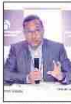
उत्कर्ष बैंक के उद्घाटन कार्यक्रम

भारतीय के प्रमुख बैंक में होने या 65 नई शाखाएं शुरू करने