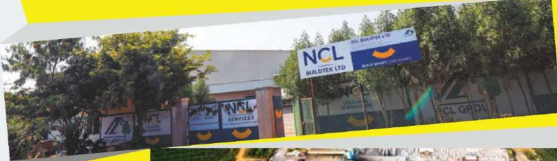
WINDOORS & SERVICES UNIT: Gundlipochampally, Medchal, Telangana - 501 401