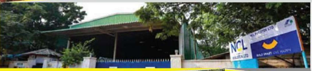
DOORS UNIT: Phase-III, IDA, Jeedimetla, Hyderabad, Telangana - 500 055