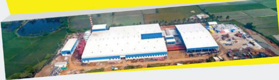
FLYASH BLOCKS UNIT: Amudalapadu, Muthukur Mandal, SPSR Nellore District, Andhra Pradesh - 524 346

Powered by strategically located state-of-the-art manufacturing facilities, we are relentlessly pushing ourselves to break benchmarks on what defines high quality building materials.