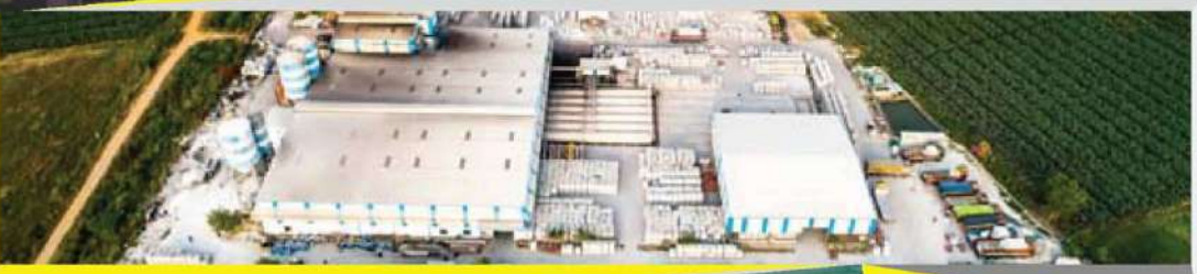
FLYASH BLOCKS UNIT: Kavuluru Village Kondapalli, G. Kondur Mandal, Krishna District, Andhra Pradesh - 524 137