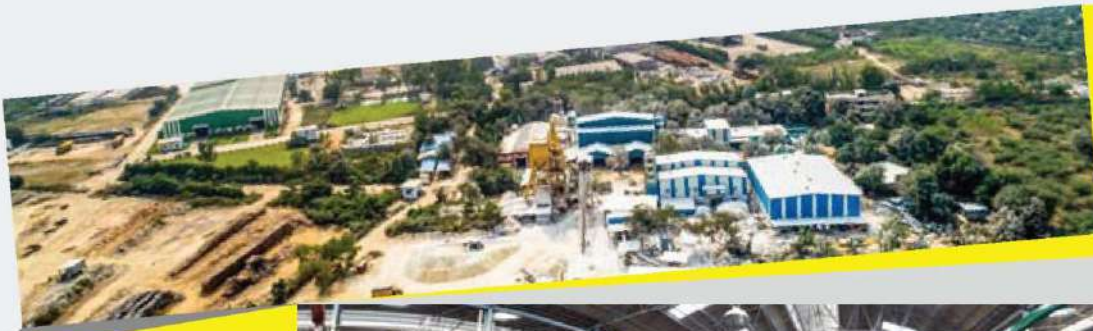
COATINGS UNIT: Simhapuri, Mattapalli Village, Mattampalli Mandal, Suryapet District, Telangana - 508 204