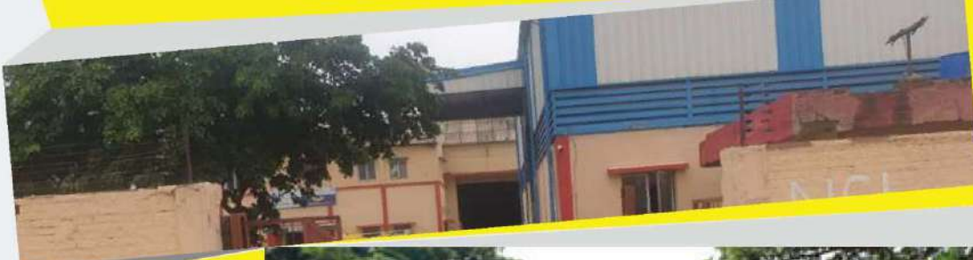
COATINGS UNIT: Industrial Area, Chopanki, Bhiwadi, Alwar District, Rajasthan - 301 019