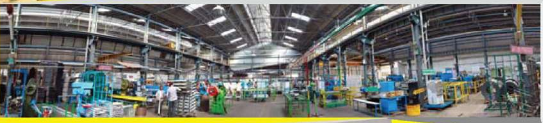
WINDOORS UNIT: Ratnapuri, Turkalakhanapur Hatnoora Mandal Sangareddy District Telangana - 502 296